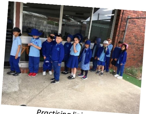
Practising lining up