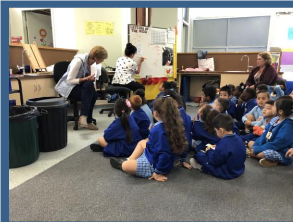
Our Prep students hard at work